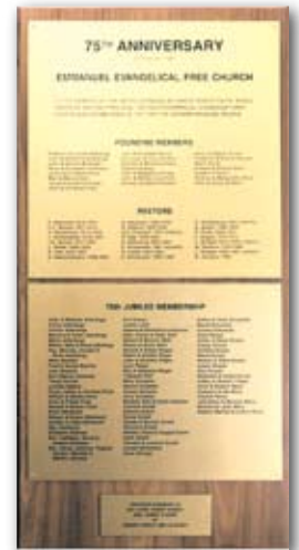
Series 701805, Double Gold-tone MetalGraph Plaque with Footer. Request a quote for custom pricing.

If you desire a larger sized plaque with fewer lines of names, choose the size plaque desired and Zax will enlarge the type to fit the plaque.