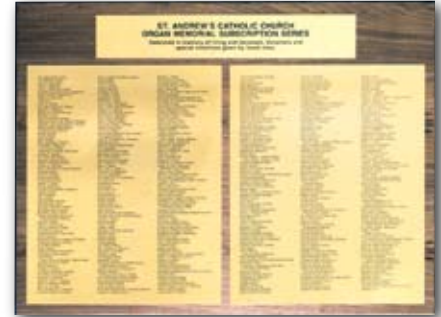
Series 701805, Double Gold-tone MetalGraph plaque with Header. Please, request a quote for custom pricing.

Fax your specifications to Zax at 603-883 6395 , and we will provide a custom quote.