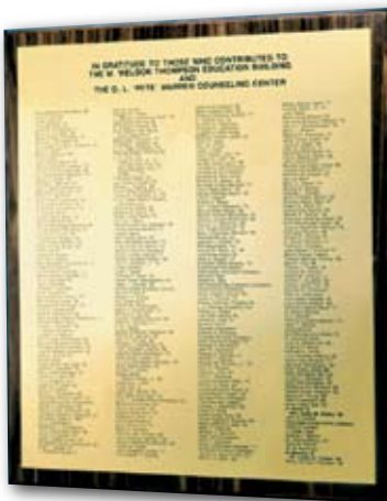
Series 701706, G 4 column. Total size: 22" x 26" with 312 names (lines). Mounted to a Walnut Panel.