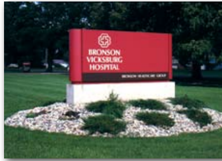
Design 33-4, Series 202336 , Illuminated routed out lettering. Radius posts and surface mount on concrete slab.