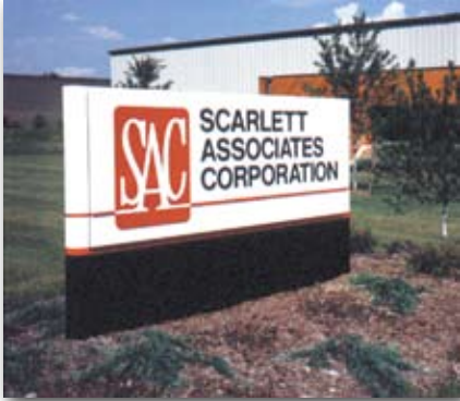
Design 33-6, Series 202334 , Non-Illuminated Lettering. Radius Posts, vinyl applied copy, direct embedment.

With smooth, distortion-free surfaces, continuously welded aluminum construction and state-of-the-art painting, Monolith Signs offer beautiful finishes that will outlast anodized surfaces. Create and convey the look you desire, with or without illumination.