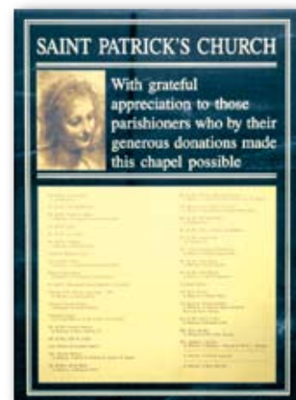
Custom Series 416246 / 707401 , MarbleGraph with a MetalGraph halftone photo plate and MetalGraph donor plate.

Extra characters are each.....$1.25 Include a logo (digitizing), add...$118.00 Engraving each logo.....$25.00 Include a Photo, add.....$95.00 Include borders, add for each.....$30.00 Beveled edges.....FREE Rounded edges, add.....$35.00