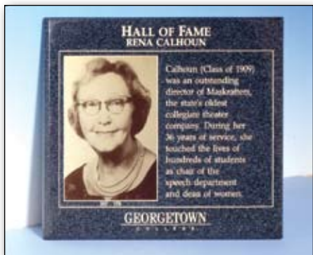
Custom Series 416246 / 707401 , Cobalt MarbleGraph with a MetalGraph halftone photo plate. Custom logo and text is SandGraphed. Submit specifications for custom quote.

Once sandblasted, the recessed image is filled in with the pigment color of your choice: white, black, charcoal, light grey, off-white, brown, tan, maroon, dark green, slate green, medium blue, metallic gold or metallic silver.