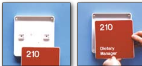
Interchangeable Insert Plates