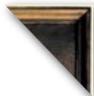
Ogee (inside curve)