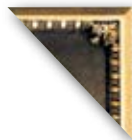
Egg & Dart (with optional corner detail)