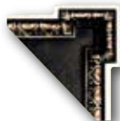
Water Leaf (with optional corner projections)