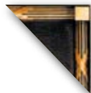
Reed & Ribbon