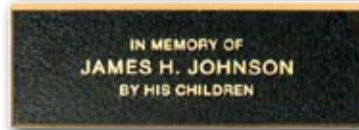
Series 702001, 9" w x 4" h Times type style. Beveled Edge.