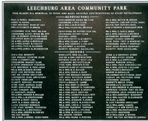
Series 702002 - Cast Aluminum Multi-Name Plaque, PP. 24" w x 20" h 110 names, Roman type. Single Line Beveled Border