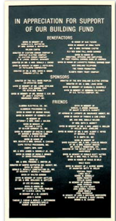
Cast Bronze Multi-Name Plaque - Series 702001. 18" w x 36" h, News Gothic Type. Single Line Border