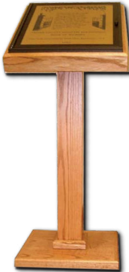
Custom Oak Display Pedestal $1,180.00

See page 6A for a complete list and visual display of standard type styles for this product