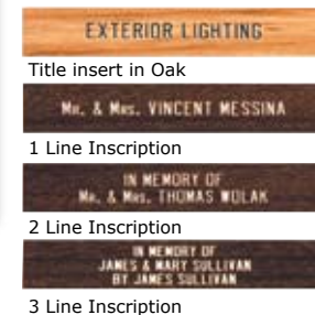
Title insert in Oak

St. Kieran Parish plaque displays Memorial Items as well as Sub Headings. This divides the plaque into other categories. By displaying specific categories, it enables you to obtain more generous contributions.