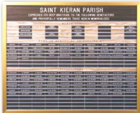
Series 703001 , R, 250 Insert Plates with Memorial Items and Sub-Headings. Normal Type Style. Overall size: 42" w x 34" h