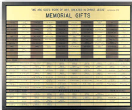
Series 703002, R, 250 Inserts with contrasting colored plates. Normal Type Style Total size: 42" w x 34" h

Call for custom order quote. Fax your specifications to Zax at 603-883-6395 , 24 hours a day!