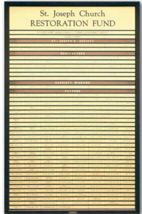
Custom Series 703002, R, 250 Inserts with contrasting colored plates. Total size: 42" w x 34" h. Times Roman Header.