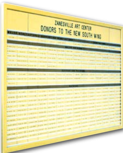
Series 703002, W, 350 Inserts with sub-headings in Bronze. Name inserts in Brass. Normal Type Style with Anodized Gold Frame. Total size: 58" w x 34" h.

The brushed brass Metalam has a black core to produce black lettering, and the brushed bronze Metalam has an Ivory core which produces ivory lettering.