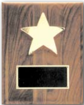
Individual Star Plaque Series 305329

Monthly Star Plaque pricing includes our Monthly Engraving Service ("One Stroke" engraving only). For Zax Monthly Engraving, just send blank plates back to Zax. Zax will return them promptly, prepaid, with one line engraved in the "One Stroke" type style (see below for visual display) which matches your other plates. This plaque's size is 11" w x 15" h.