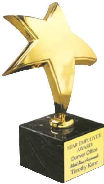
Star Trophy Series 303411 also available in a smaller size Series 303412