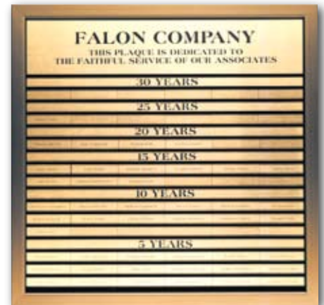
Solid Brass inserts, refer to page R8.

Warm recognition displayed to all will do much to honor your long-term employees - and will give all of your employees a feeling of appreciation and pride. Boost morale with a Zax Anniversary Plaque.