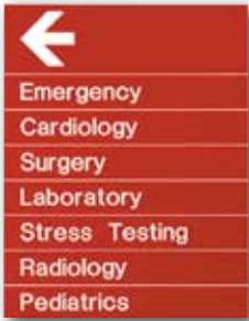
H & A with Helvetica Type

60 colors, 4 materials (see 4A), 12 type styles (see 5A), and 12 component shapes (three styles of 2", 3", or 4" height) make this option highly customizable. Signs have beveled edges and pressure-sensitive adhesive backing. Can be framed with M-22 Framing (see page R9).